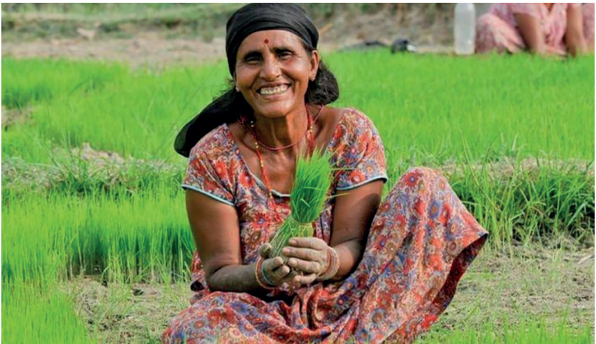
Neem coated urea – farmers are happy

There has been no major incidence of shortage of urea in the last five six years in any part of the country since the decision was taken and farmers are happy that genuine and neem coated urea is being made available to them by government at affordable prices, in the right time and in adequate quantities.